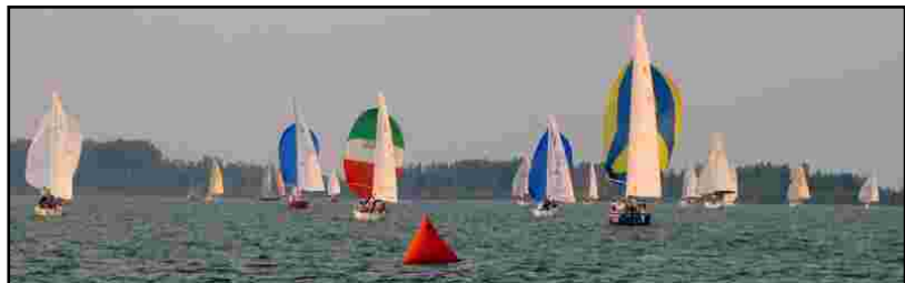
A beautiful Wednesday night downwind leg.

JAM and PHRF captains - To avoid the annual mad rush to get results compiled and flags ordered in time for the awards banquet, please submit results for the Spring and Summer series by Sept. 9. I will order flags for these two series on Sept. 10. This will give the flag shop more time to prepare the flags for these two series. Flags for the Fall and Away series and for special fleet awards will be ordered no later than four weeks before the banquet. Thanks! — Don Guy, donguy@aol.com