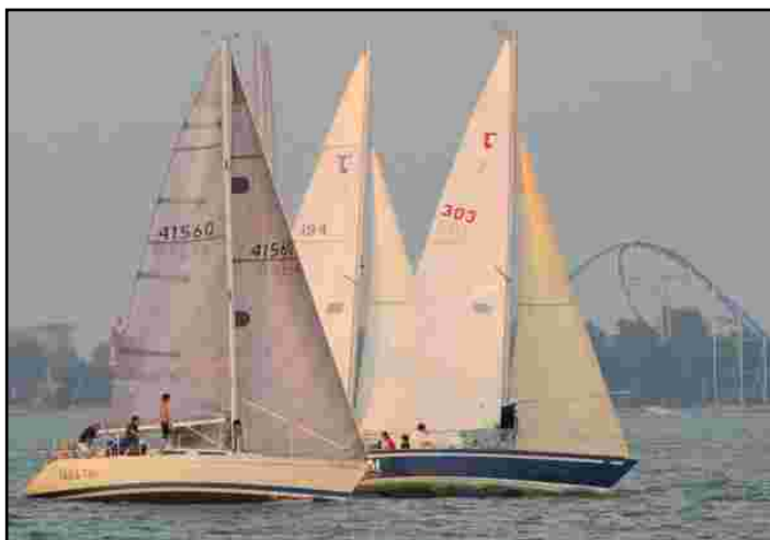
Tight Wednesday night action.

Race Committee / Sunday Racers Season Wrap Up Potluck - Sunday, Sept. 22 following the morning races. Race Committee members and racers are invited to join in a potluck brunch to wrap up the season. Bring a dish and your best racing tales to share. Contact Joyce Keane with questions 419-433-2648