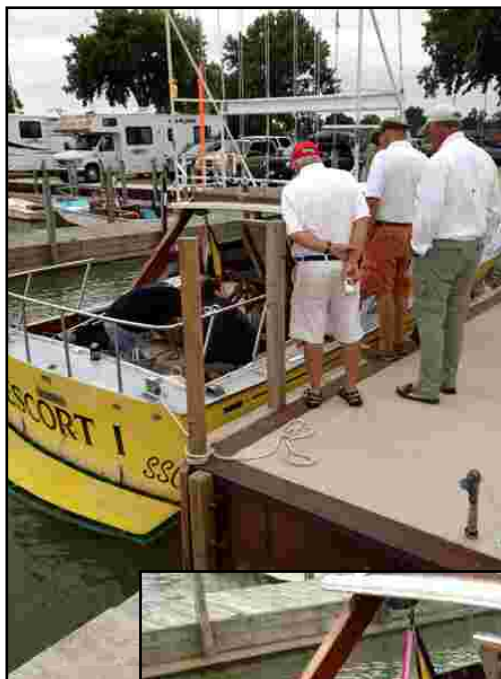
A crew supervises repairs to the transmission of Escort I during the Thistle Nationals.